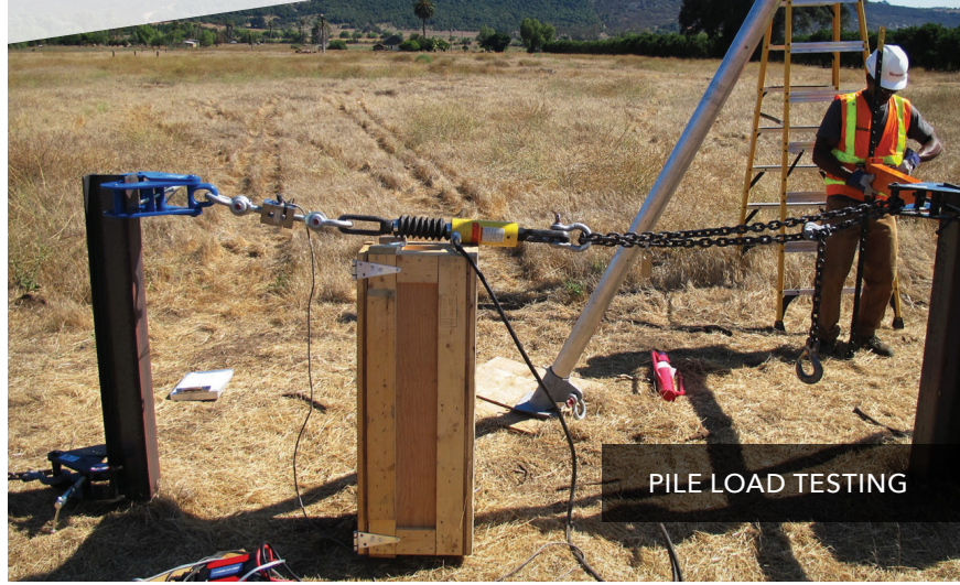
PILE LOAD TESTING