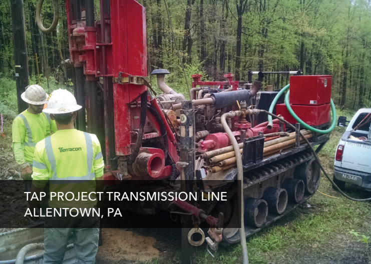
TAP PROJECT TRANSMISSION LINE ALLENTOWN, PA