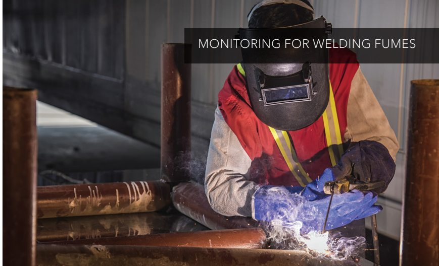
MONITORING FOR WELDING FUMES